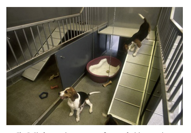
Fig. 5. Platforms and toys as cage refinement for laboratory dogs.

Pigs and mini pigs are sociable and exploratory animals (Holtz, 2010). Whenever possible, pigs and mini pigs should be purchased in groups already established from familiar or socially compatible animals. A social dominance order is quickly established. As males in the wild tend to be solitary, except during the mating season, sexually mature males might fight fiercely when housed together (Holtz, 2010). They should have permanent access to sufficient straw, hay or sawdust to enable proper investigation and manipulation activities such as rooting. Hay and straw are the materials of choice for mini pigs, as they prevent gastric mucosal hyperkeratosis and provide environmental refinement. Balls with a hole where food pellets can be hidden can be used for play and foraging (FELA-SA, 2006). When given the opportunity, mini pigs are clean, choosing specific sites for defecation and urination, while keeping their nest area clean (Holtz, 2010).