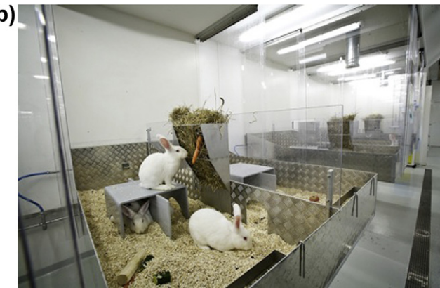
Fig. 4. Example of standard housing for rabbits in two different animal facilities in Europe. (a) Standard rabbit housing at GDL, The Netherlands; (b) standard rabbit housing at Novo Nordisk A/S, Denmark.