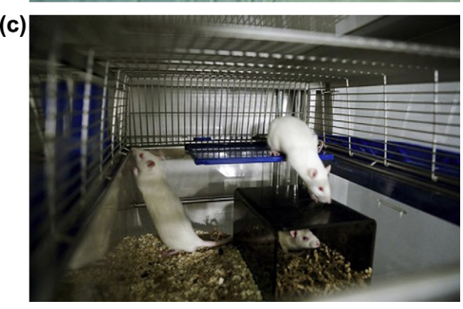
Fig. 3. Standard housing for rats over the course of 50 years. (a) Standard housing for rats around 1960; (b) standard housing for rats around 1990; (c) standard housing for rats around 2010.

the location of the air supply to the cage (from the wall or from the top), the ventilation rate and the presence of nesting material are all important considerations when assessing the impact of IVC housing on the well-being of mice. Evidence that animals are reacting to draughts could be a change of location of the nest and the building barriers of bedding.